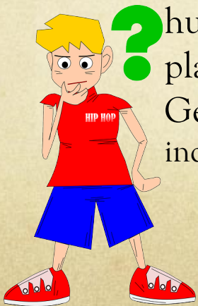
Image: https://openclipart.org/detail/7657/boy-question-?-by-romanov Public Domain